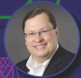
Tom Gump Rotary Membership

The 2022/23 Conference is a collaboration of 2 Rotary Districts celebrating resilience & inspiration! This conference is PACKED full of inspiring speakers & relevant fellowship!