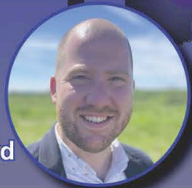
Kirk Langford Youth Exchange