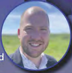
Kirk Langford Youth Exchange