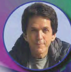
Mitch Albom Author, Philanthropist